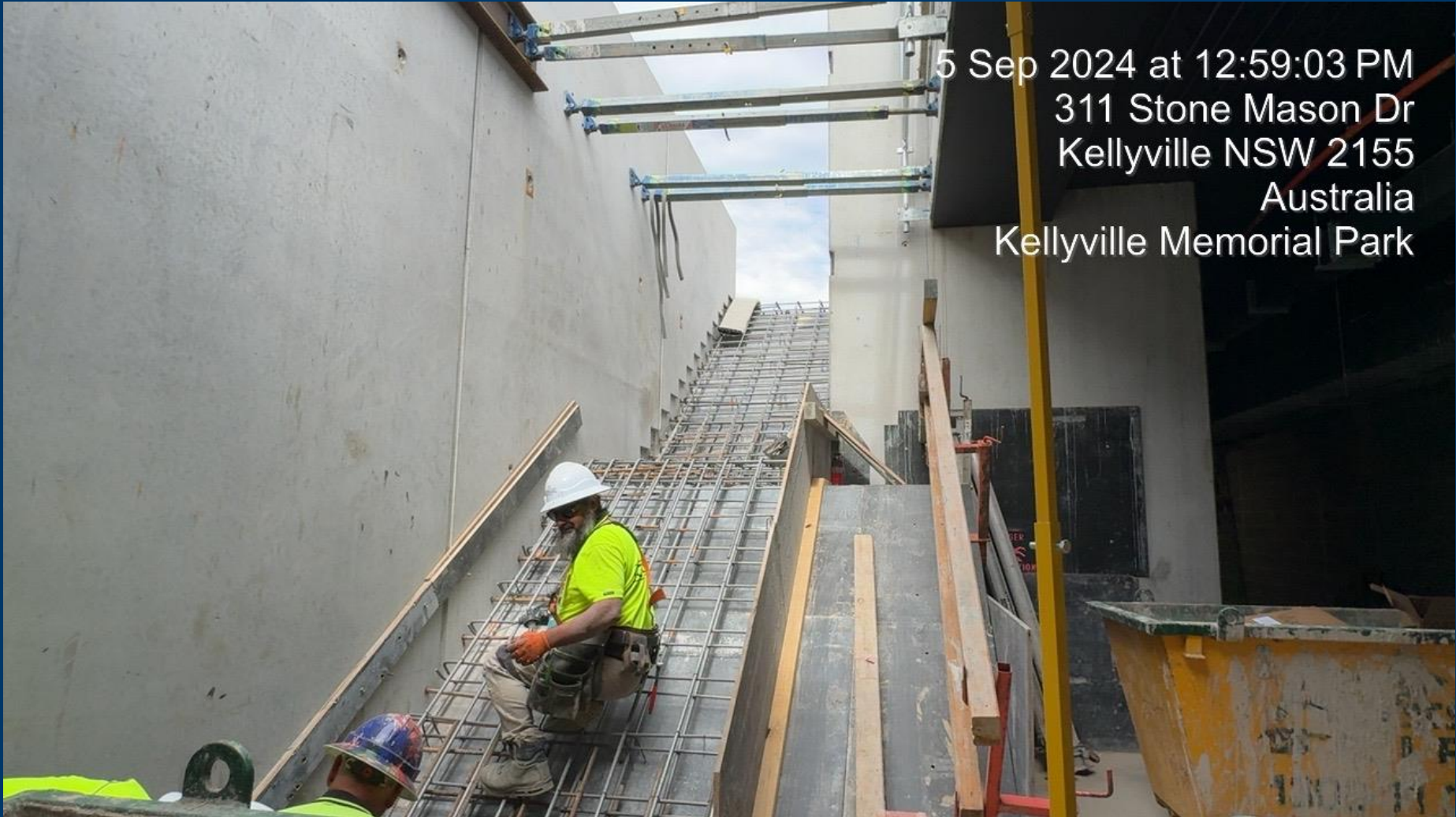
Building A- Formwork and Steel fixing to Stair 1

5 Sep 2024 at 12:59:03 PM 311 Stone Mason Dr Kellyville NSW 2155 Australia Kellyville Memorial Park