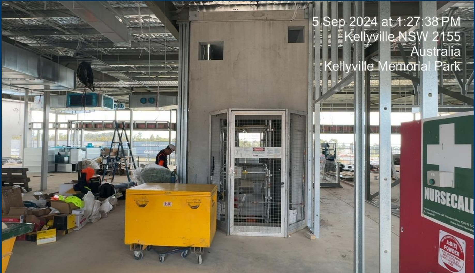
Building B – Commencement of Lift Installation