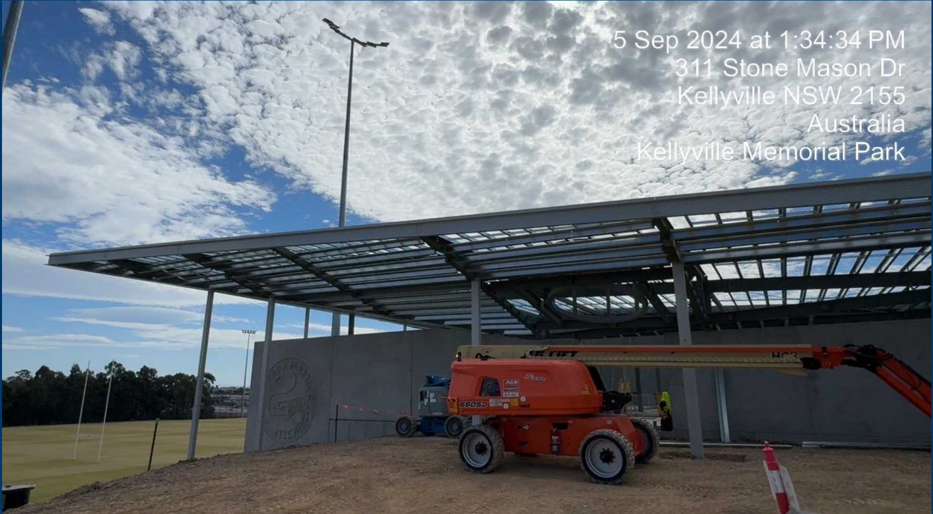
Building B – Completion of Structural Steel

5 Sep 2024 at 1:34:34 PM 311 Stone Mason Dr Kellyville NSW 2155 Australia Kellyville Memorial Park