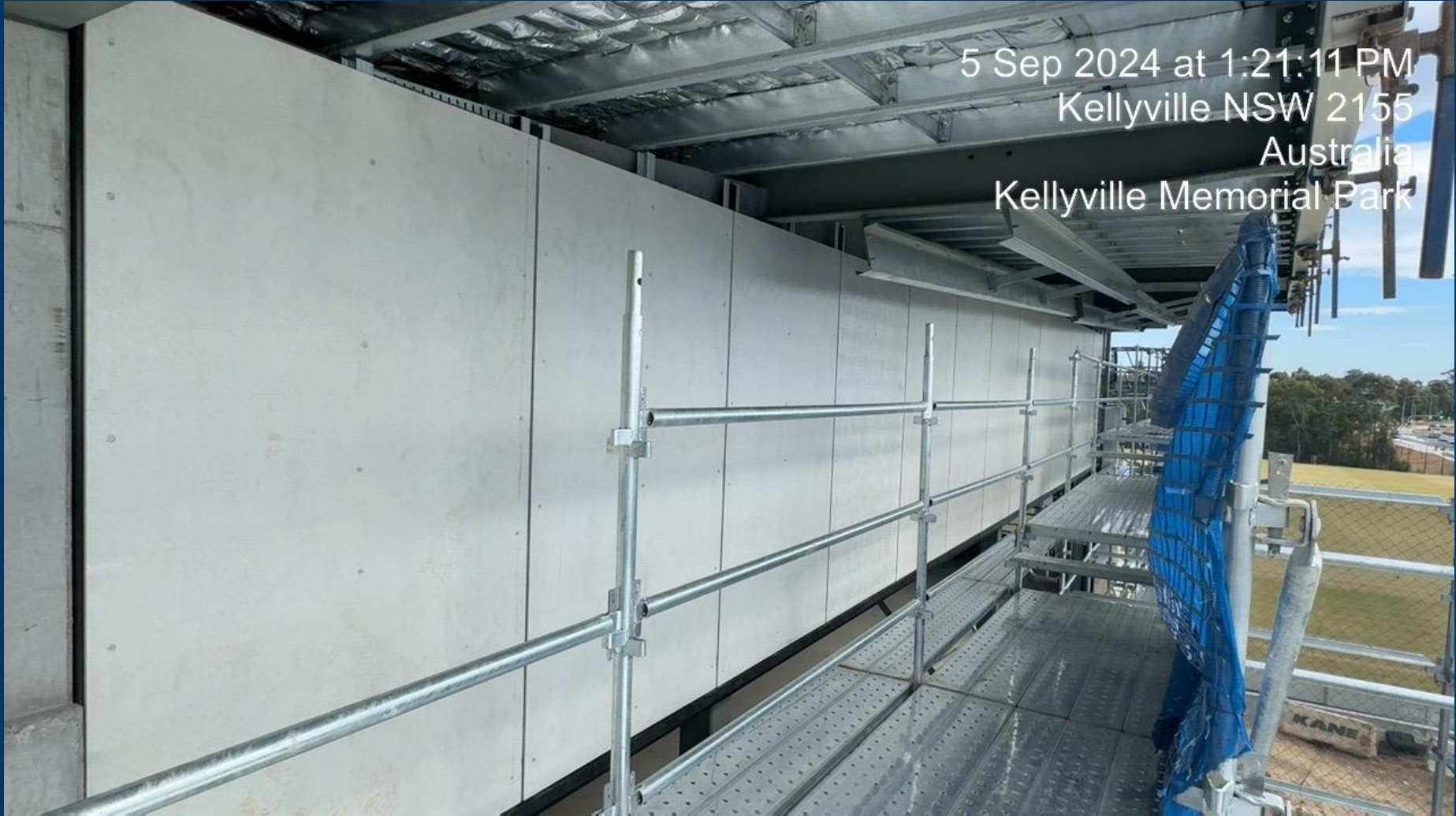
Building B – Installation of External Cladding to North Elevation

5 Sep 2024 at 1:21:11 PM Kellyville NSW 2155 Australia Kellyville Memorial Park