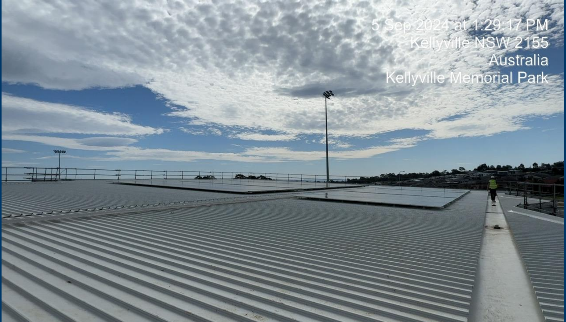
Building B – Solar Installation

5 Sep 2024 at 1:29:17 PM Kellyville NSW 2155 Australia Kellyville Memorial Park