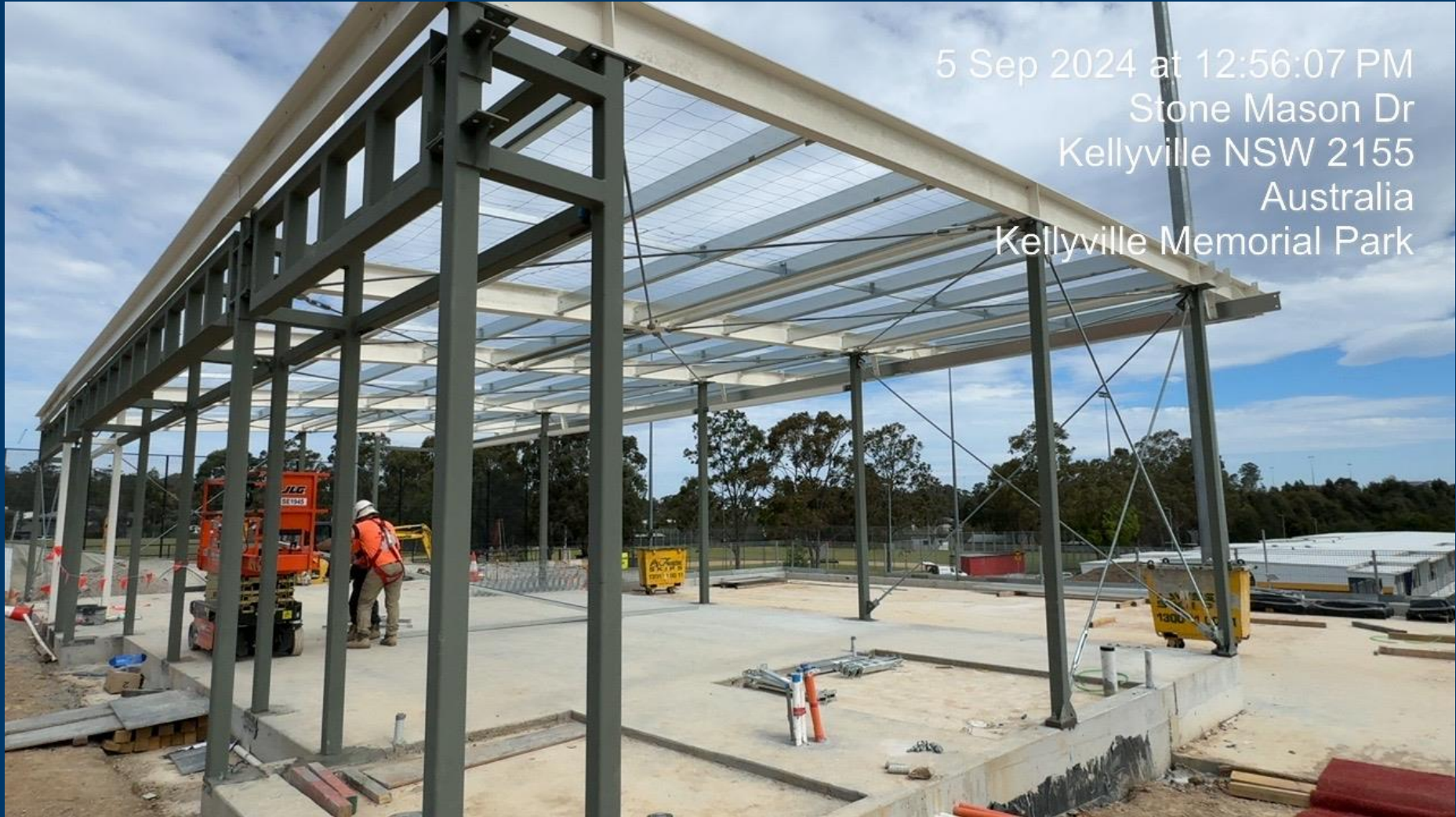
Building A- Roof Mesh to Tenancy Area

5 Sep 2024 at 12:56:07 PM Stone Mason Dr Kellyville NSW 2155 Australia Kellyville Memorial Park