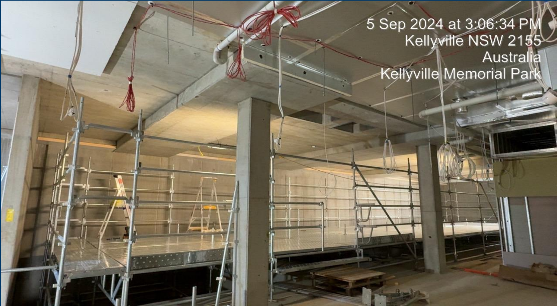
Building B – Scaffold Installation to Pool Area

5 Sep 2024 at 3:06:34 PM Kellyville NSW 2155 Australia Kellyville Memorial Park