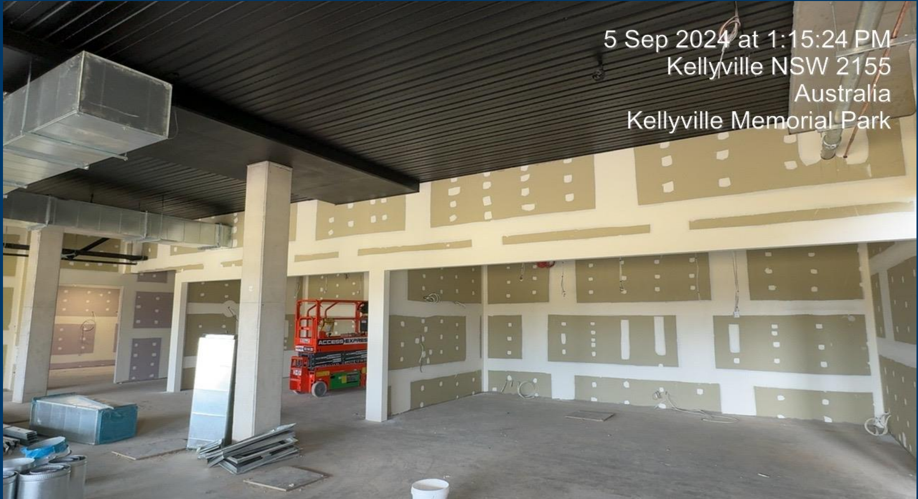
Building B – Pour 2 Area Sheeting & Sanding

5 Sep 2024 at 1:15:24 PM Kellyville NSW 2155 Australia Kellyville Memorial Park