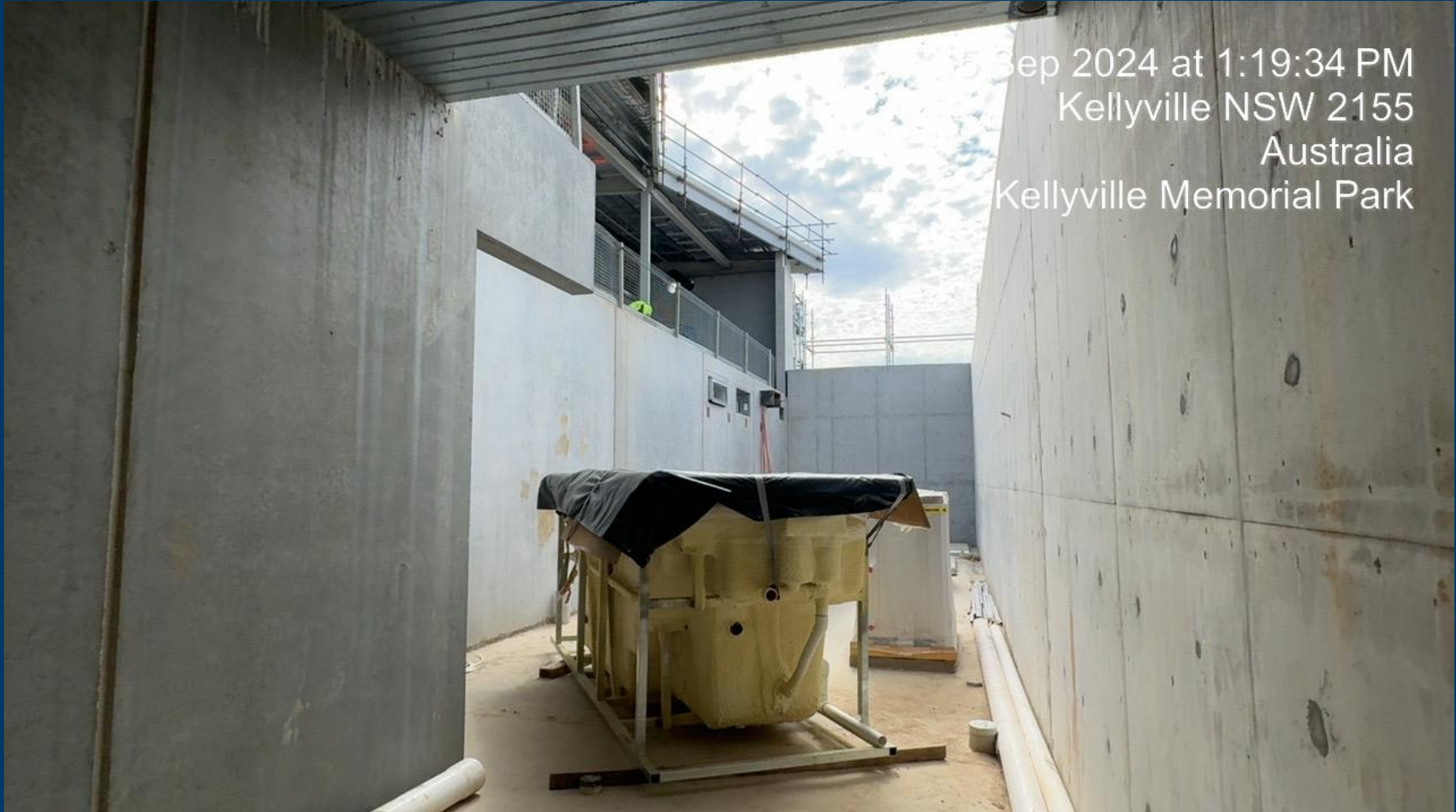
Building B – Arrival of Hot & Cold Tub

5 Sep 2024 at 1:19:34 PM Kellyville NSW 2155 Australia Kellyville Memorial Park