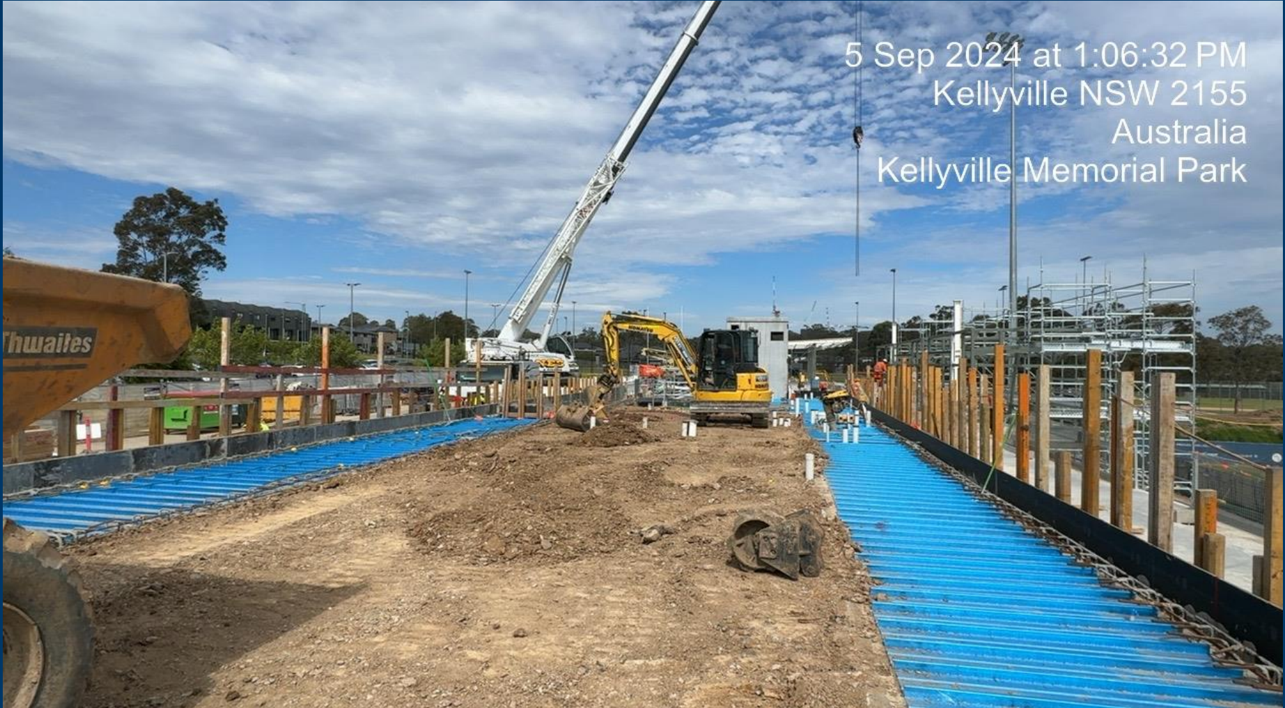
Building A – Detailed Excavation to Pour 4

5 Sep 2024 at 1:06:32 PM Kellyville NSW 2155 Australia Kellyville Memorial Park