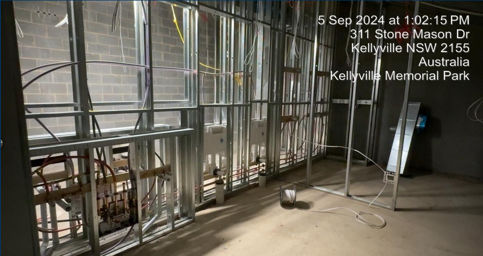
Building A – Services Roughin Male Bathroom LGF

5 Sep 2024 at 1:02:15 PM 311 Stone Mason Dr Kellyville NSW 2155 Australia Kellyville Memorial Park