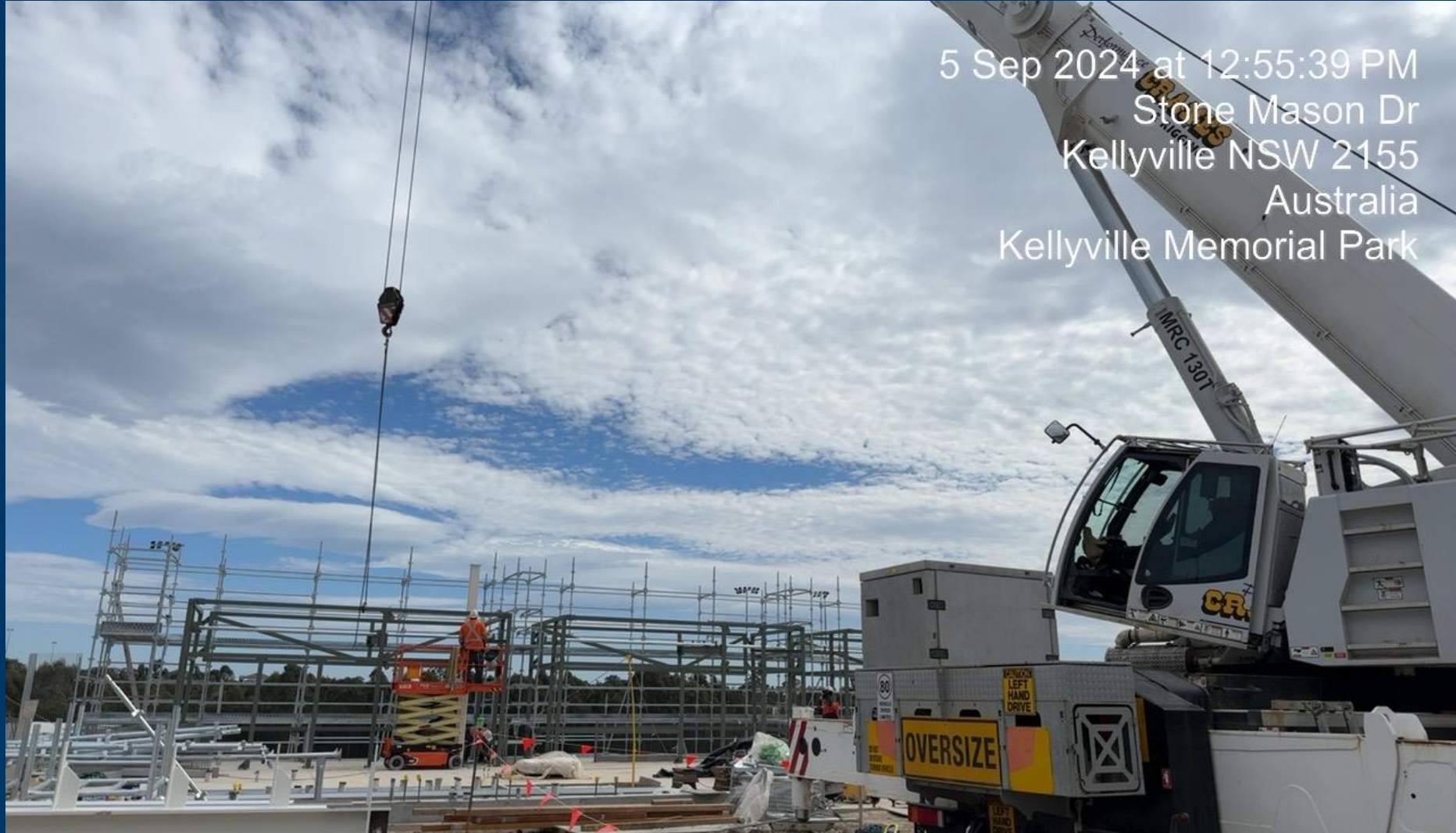
Building A- Structural Steel Installation to Coaches Box

5 Sep 2024 at 12:55:39 PM Stone Mason Dr Kellyville NSW 2155 Australia Kellyville Memorial Park