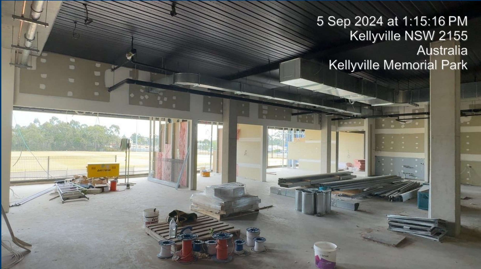
Building B – Pour 1 Area Sheeting & Setting

5 Sep 2024 at 1:15:16 PM Kellyville NSW 2155 Australia Kellyville Memorial Park