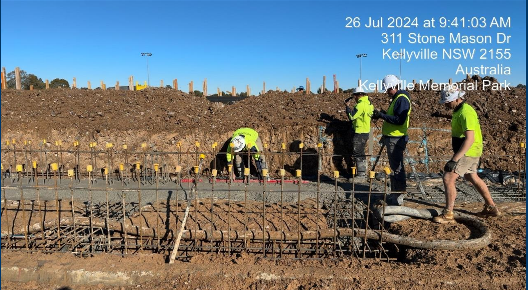
Building A – Upper Floor Pour 3 Footings

26 Jul 2024 at 9:41:03 AM 311 Stone Mason Dr Kellyville NSW 2155 Australia Kellyville Memorial Park