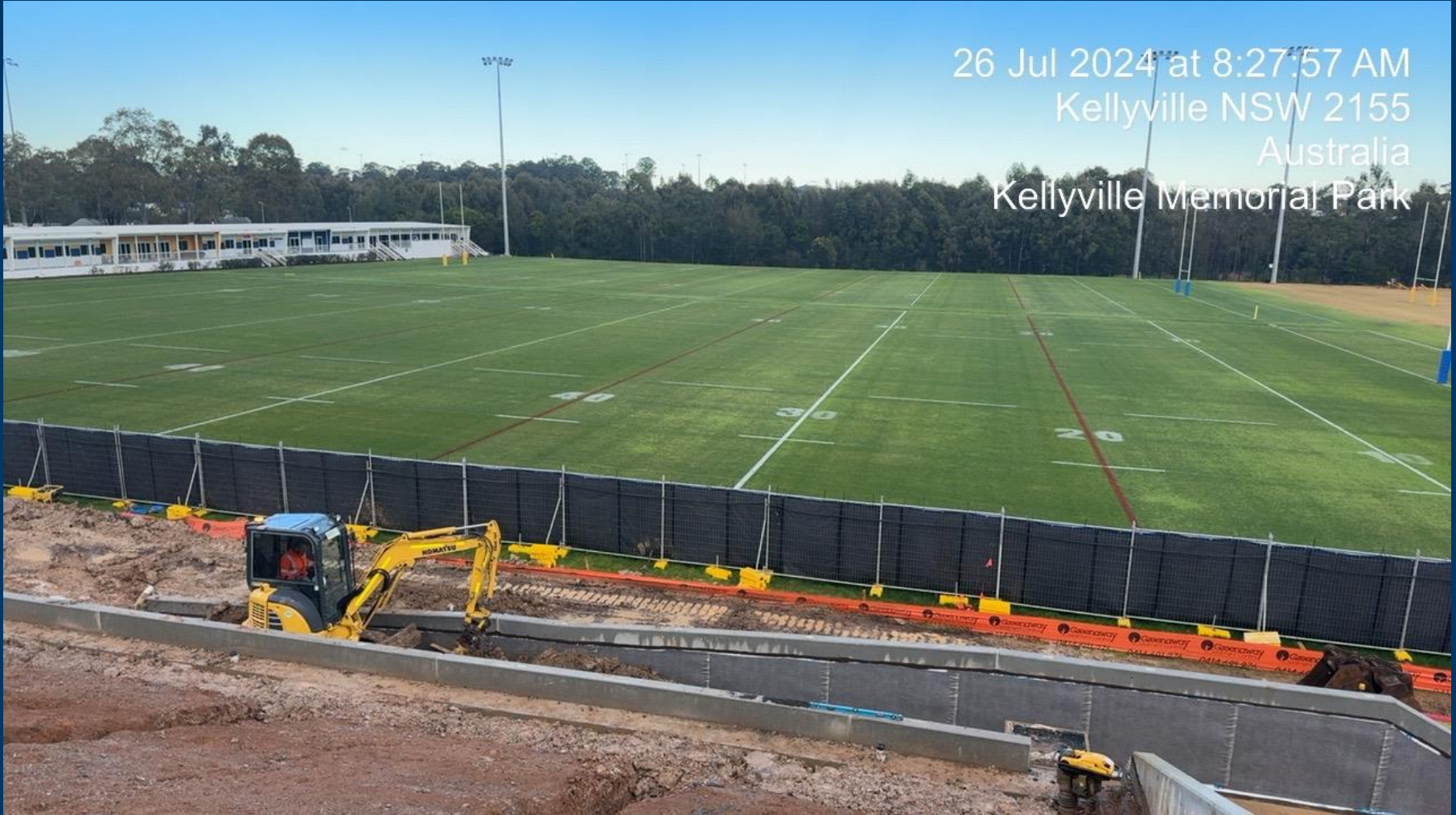
Building A – Detailed Excavation External West

26 Jul 2024 at 8:27:57 AM Kellyville NSW 2155 Australia Kellyville Memorial Park