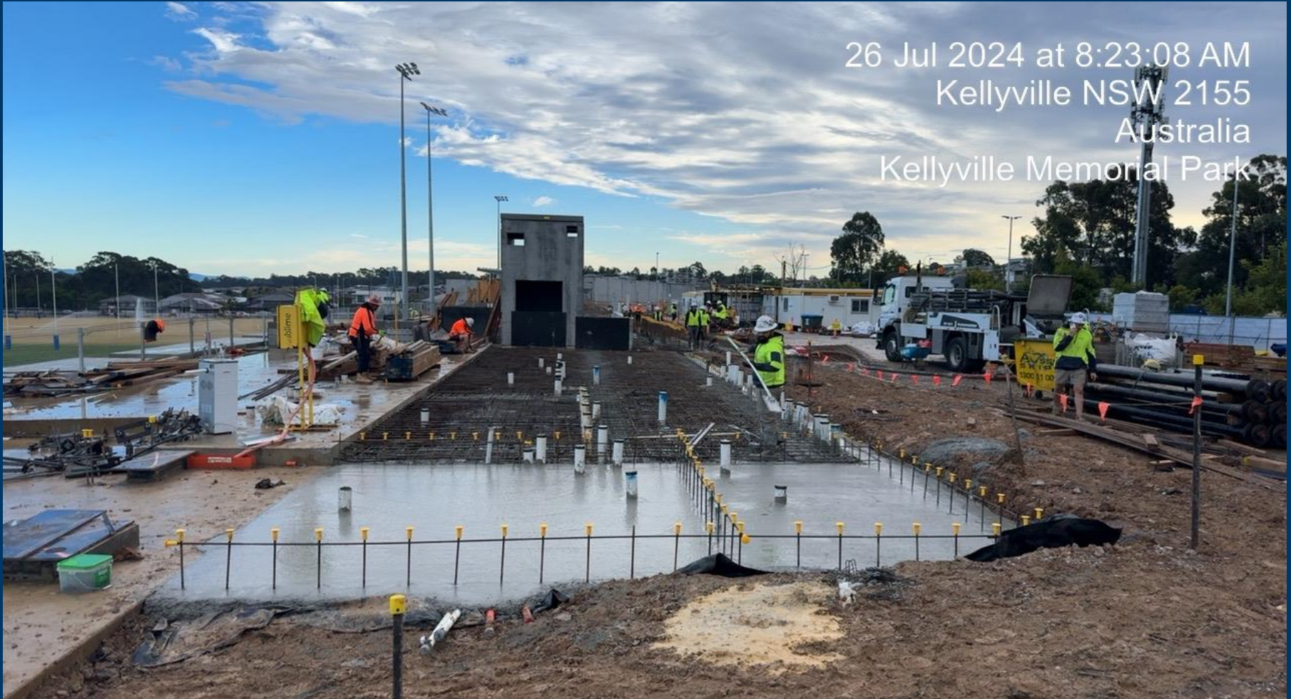
Building A – Upper Floor Pour 3 Footings

26 Jul 2024 at 8:23:08 AM Kellyville NSW 2155 Australia Kellyville Memorial Park