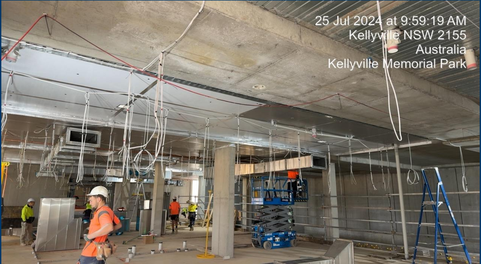
Building B – Lower Ground Floor Services Work Pour 2 area

25 Jul 2024 at 9:59:19 AM Kellyville NSW 2155 Australia Kellyville Memorial Park