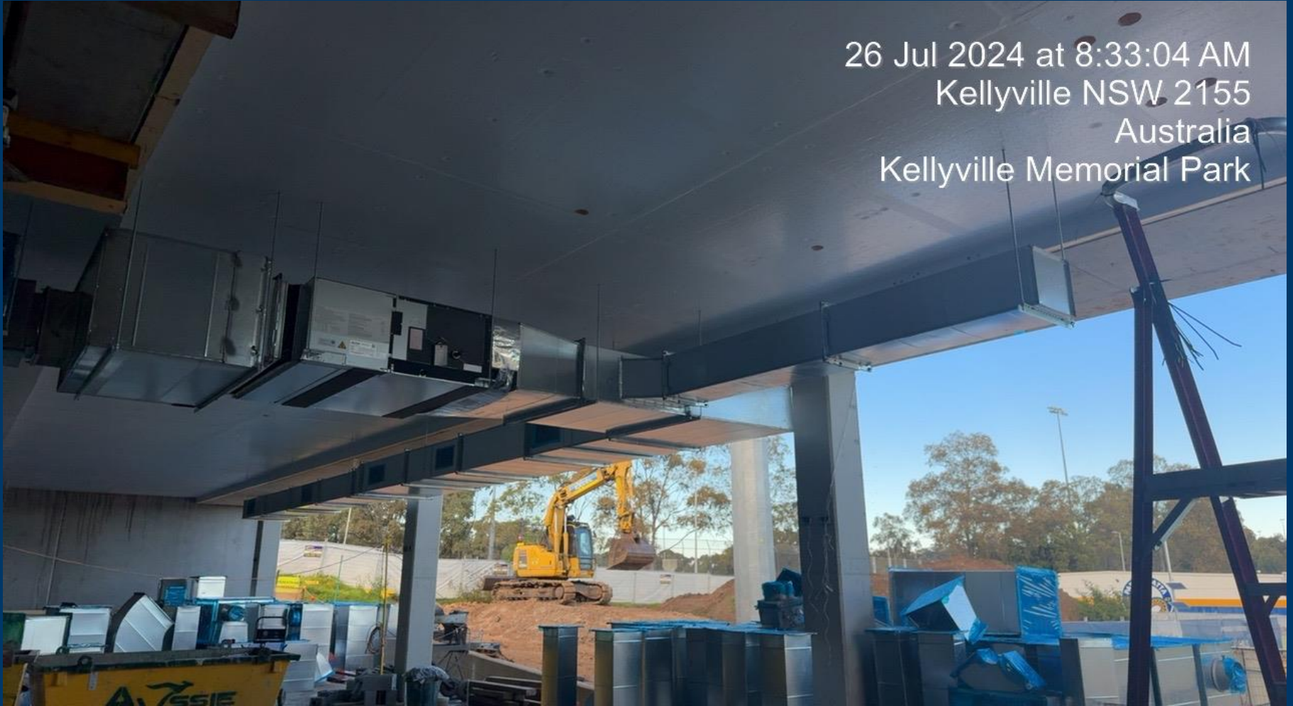
Building A – Commencement of Services Lower Ground Floor (Gym)

26 Jul 2024 at 8:33:04 AM Kellyville NSW 2155 Australia Kellyville Memorial Park