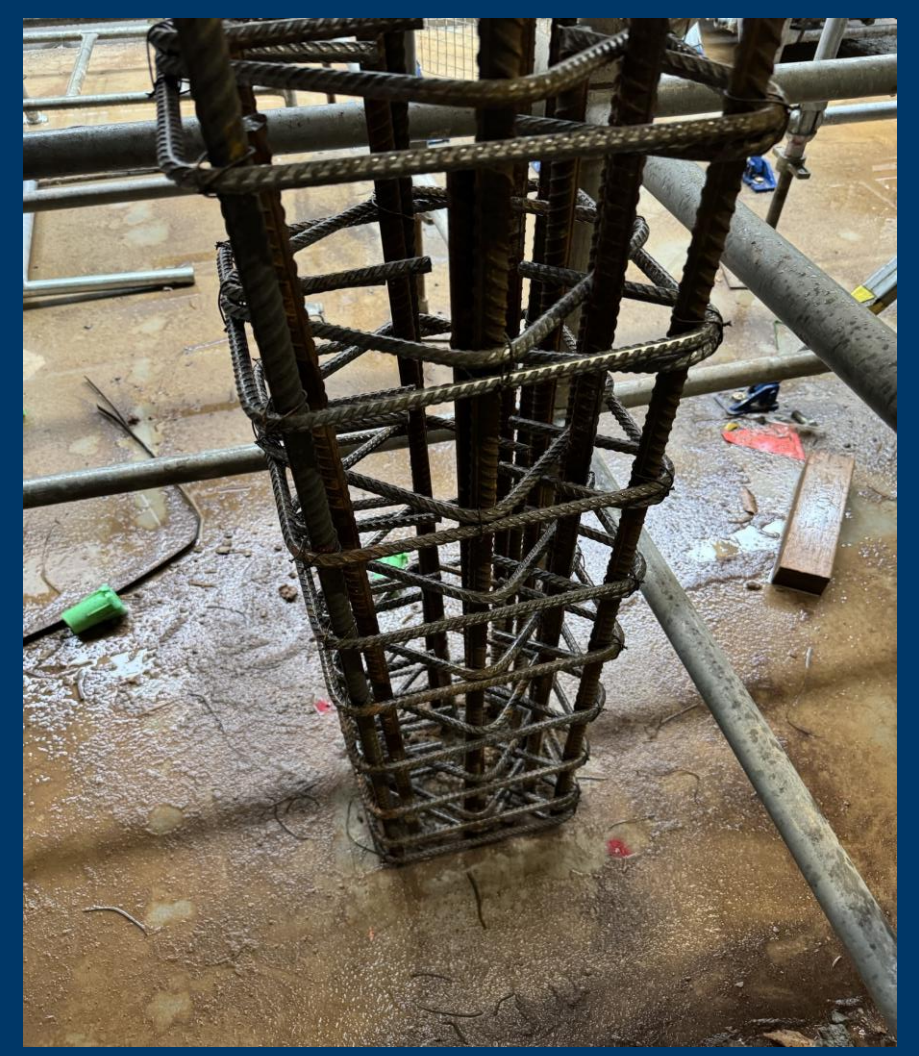
Building A –Lower ground floor columns