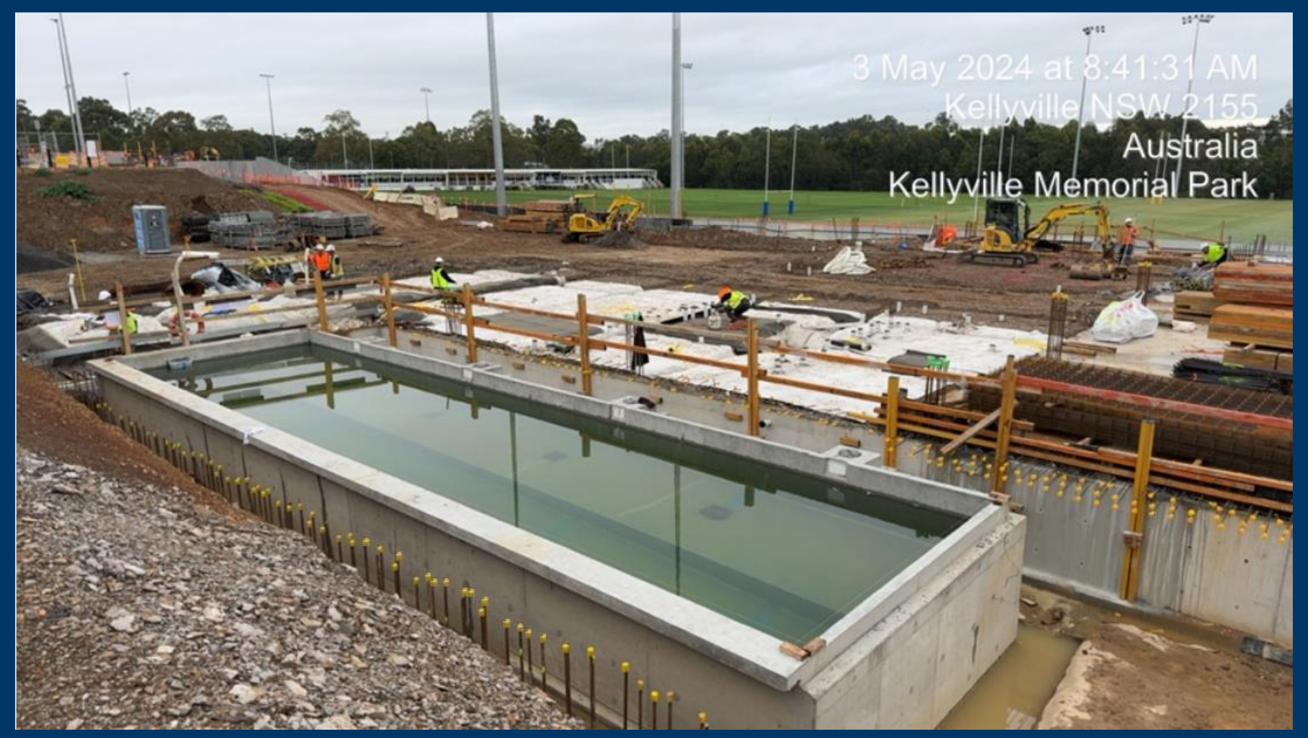
Building B – Pool water testing