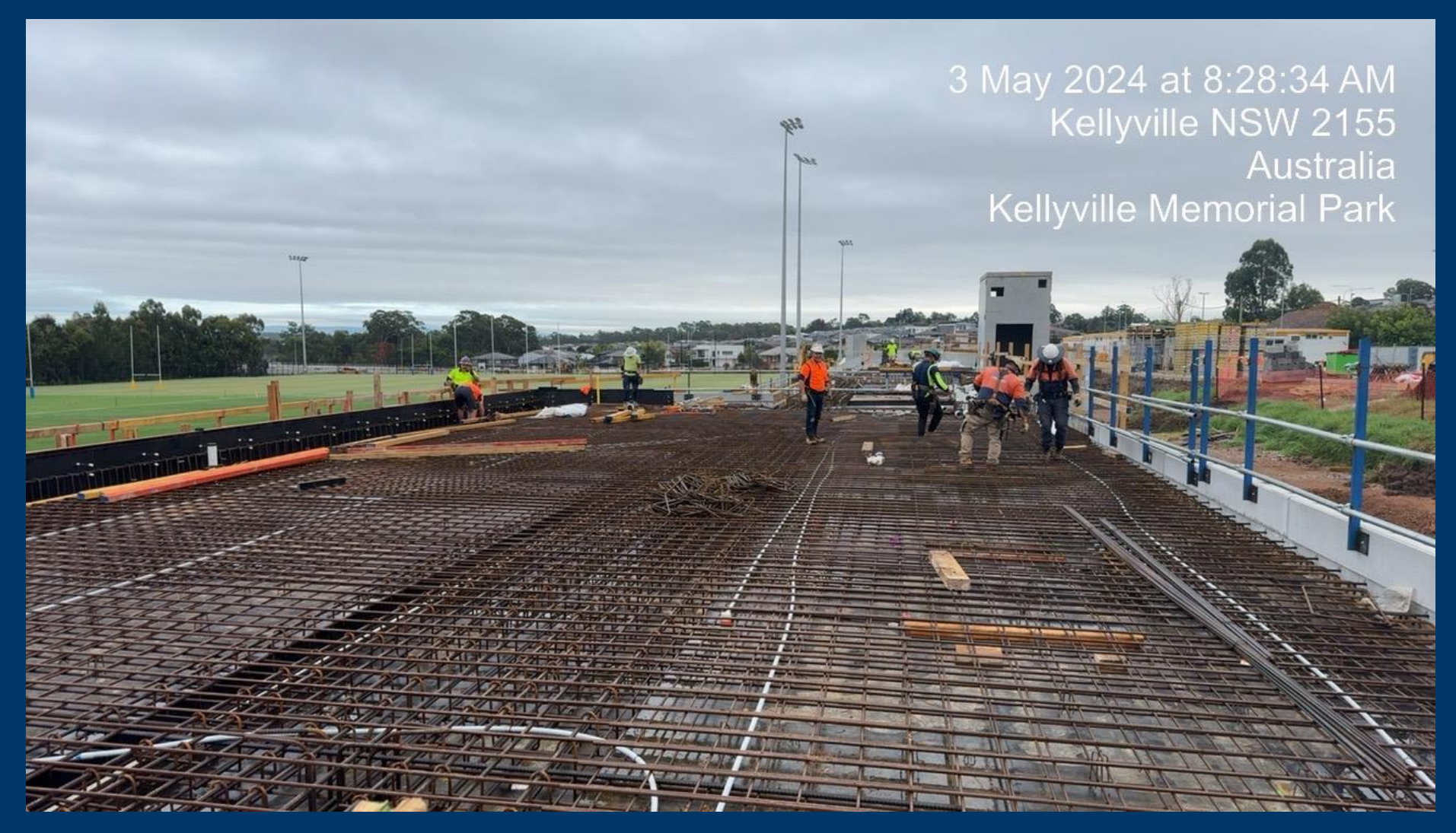
Building A – Steel fixing to suspended deck